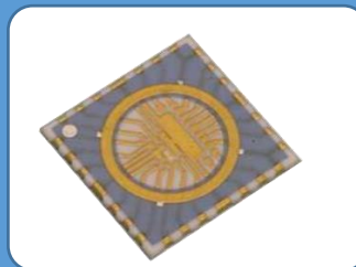
LED sensor: Leadless SMT package for direct PCB mount with 25µm Cu on BeO, metal plugged via holes, castellations and multilayer dielectric.