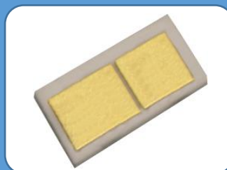
AlN ceramic carrier with copper metallization and Ni-Au finish for an LED with pad down design (50µm gap) for a high volume application.

Remtec, a RoHS compliant, ISO 9001:2008 registered and ITAR compliant company, provides ceramic packaging solutions for optoelectronics, microwave/RF components and modules and DC power electronics. Applications include high performance laser, photo diode and LED submounts, optoelectronic circuits, spacers, power modules as well as RF power amplifiers and TC modules.