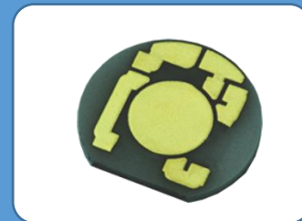
AlN ceramic mount with thick film silver metallization and Ni-Au finish for a high intensity LED (400nm) for polymerizing light cured dental materials.